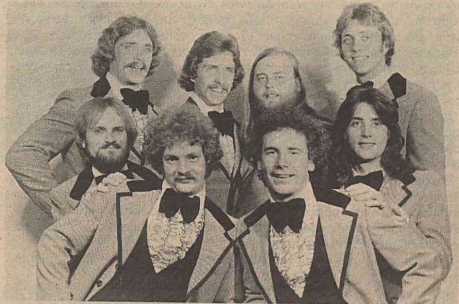
Sugarcreek will perform on campus during Winter Weekend, Feb. 11-13.