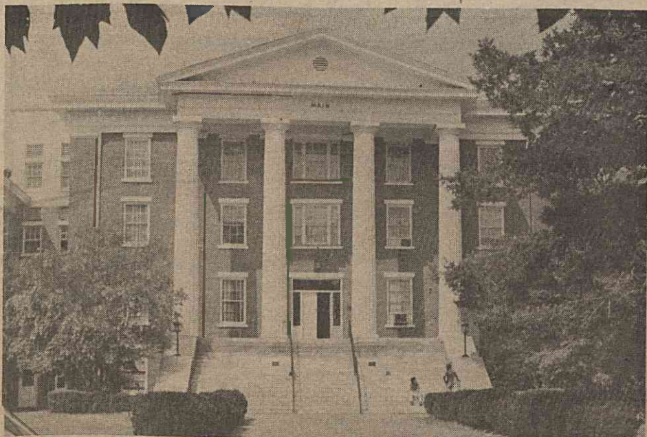
Main Building - Louisburg College

Again, Wake County leads with 134 students and Franklin County second with 74 enrolled. Other major counties represented are Durham, Cumberland, Edgecombe, Guilford, Johnston, Nash, New Hanover, Vance, and Wilson.