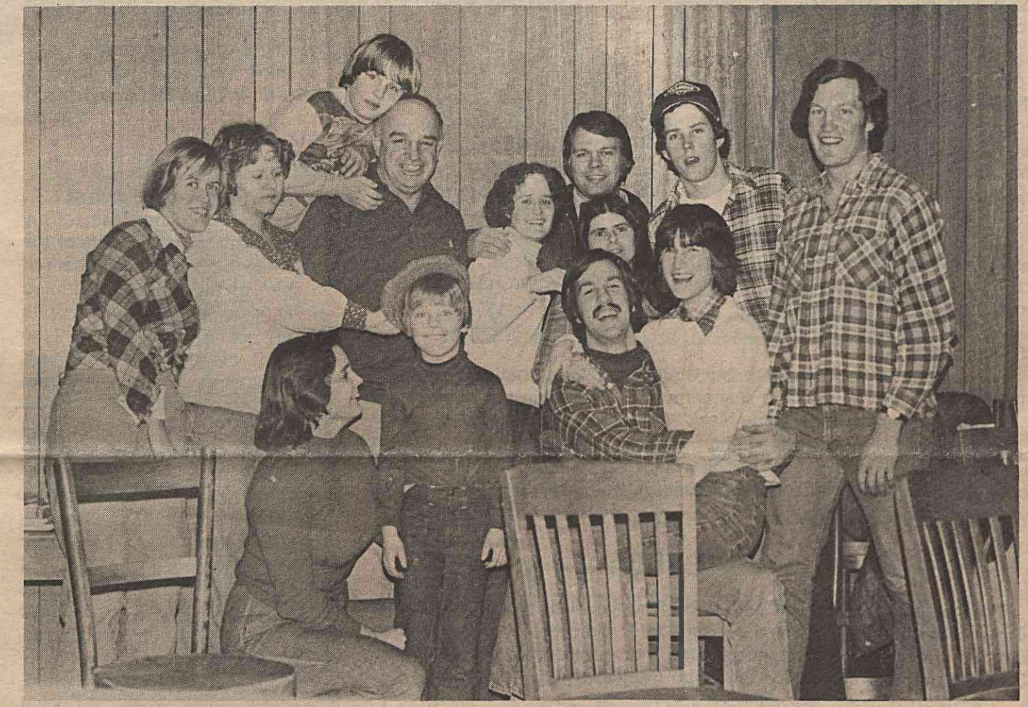
Smiles and Gigles were the order of the day for the CLC group on the retreat.