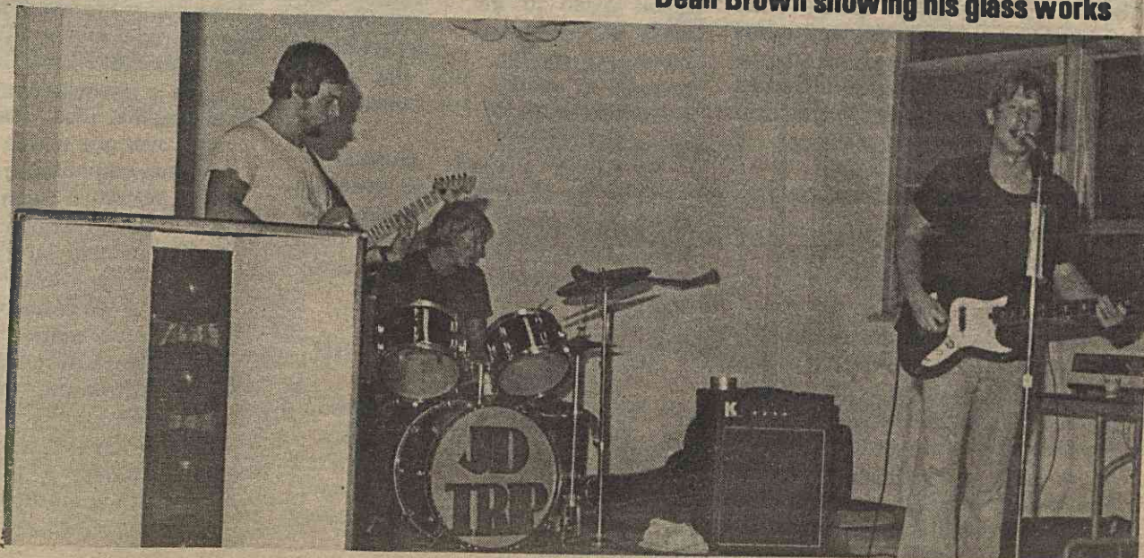
The JD Trip Band - R. L. C. First Program