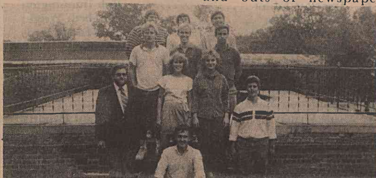
The Columns Staff

can believe these hopes will blossom into reality.