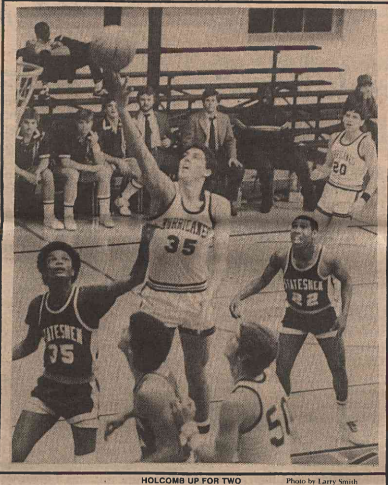
HOLCOMB UP FOR TWO