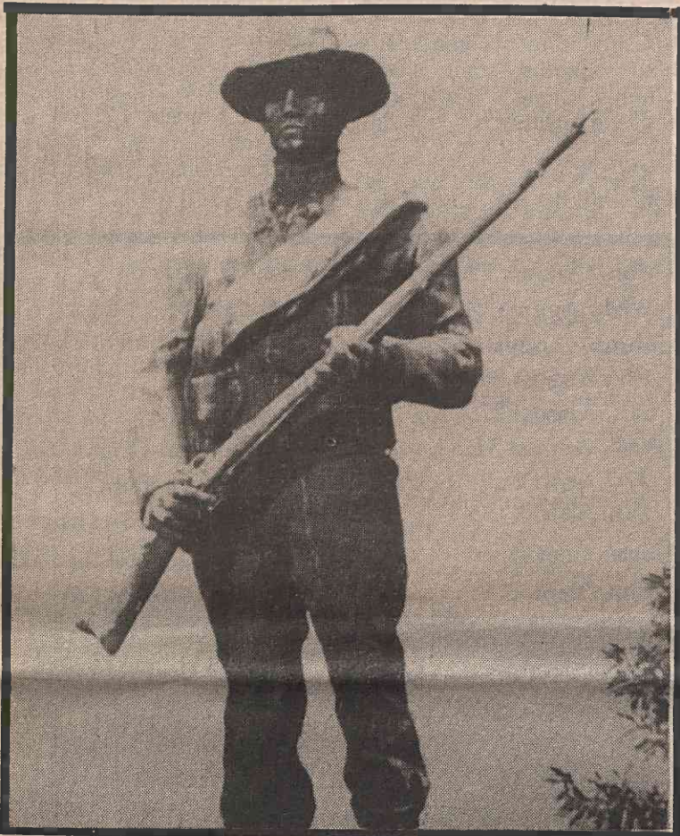
The Confederate Statue on Main Street is named "Silent Sam" by the college students.