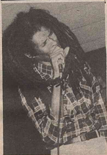
The Awareness Art Ensemble