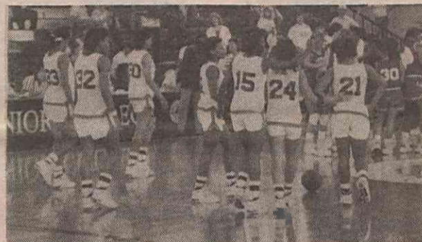
The NJCAA Women's Basketball National Tournament in Tyler, Texas.