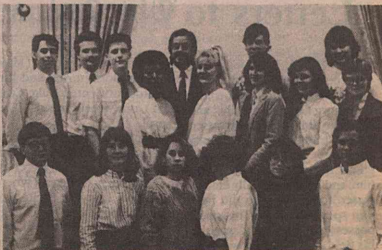
The Peace Group made an ambitious start.