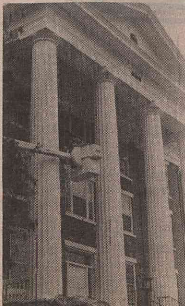
The restoration of Main was swift and sure.