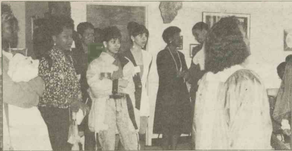
The Sonja H. Stone Black Cultural Center at UNC-Chapel Hill is a one-room former snack bar