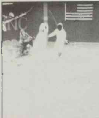
A black Zorro? Meet the black fencers. Page 11