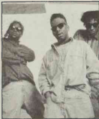
Record reviews tell what's wack and what's not. Page 10