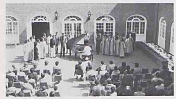
The UNCW Gospel Choir sang in the courtyard of the newly-opened University Union.

Union and the Social and Behavioral Sciences Building. "This has really grown!" said one alumna as she walked through some of the 600 acres of UNCW. "I remember when there were just three buildings, and the library was in Alderman," said another alumnus who graduated when Alderman, Hoggard and James Halls were the only buildings on campus.