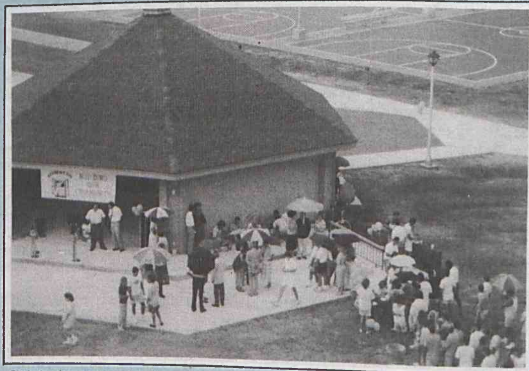
Students enjoy an outdoor picnic dinner as part of the opening of the recreation / gazebo area, located between the University Apartments and Dorm 85.