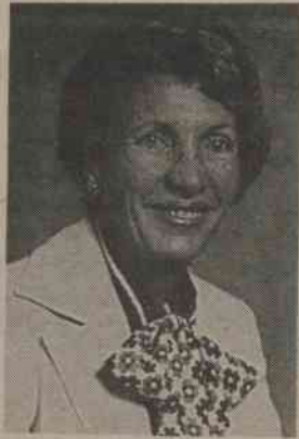
Sad is the passing of one whose life and energy we have known and loved....