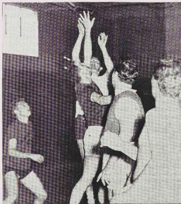
Hands get in your eyes

Teaching them to observe all things whatsoever I have commanded you; and, lo, I am with you always, even unto the end of the world. Amen.