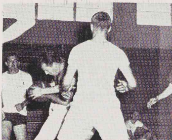
Setzer pulls quarterhack sneak with two for First HAPY.