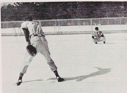
Ready for spring practice but unable to "warm up" because of the snow, two prospective baseball players practice using a snowball as a substitute for a baseball.