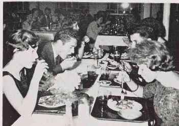
Students enjoying the Thanksgiving dinner, a tradition at GW.