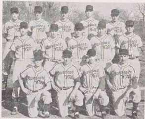
GARDNER-WEBB BASEBALL TEAM