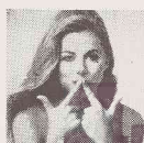
You have to look for the "W" because it's silent