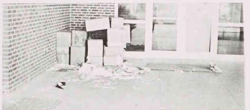
Taking care of business as G. W. students return.