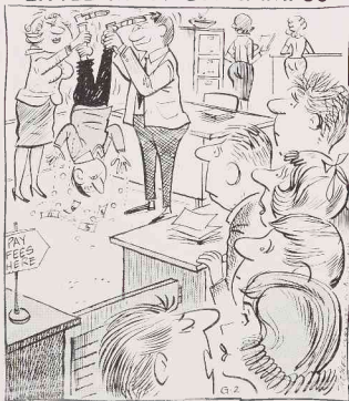
THEY SET THEM RAISED THE TUITION AGAIN THIS YEAR."