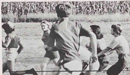
Traffic is heavy as HAPY's quarterback is pursued by the Stroup team in recent women's intramural football action.