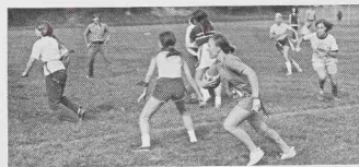
Stroup and Nanney coeds battle it out in Powder Puff football. Nanney won over Stroup in semi-finals and went on to beat Happy for the finals, October 15.