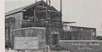
Work on the new John R. Dover Memorial Chapel, above, is near completion. It will provide a main focal point at the entrance to the college.

The $300,000 building will seat 336 in the chapel area, house eight offices and three classrooms in the basement. The basement is hoped to be finished by February. The chapel offices include a Baptist Student Union office and college minister's office.