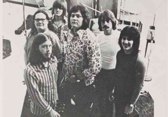
The Atlanta Rhythm Section are scheduled for Thursday, May 4, in Best Gym, from 9:00 until. This is the day before Dead Day.

Any vacancies on the squad which due to becoming ineligible to represent the college, resignation, or any other reason must be filled according to the guidelines. The student senators should decide if the vacancies warrant selections. Special elections may be scheduled by a majority vote of the Senate.