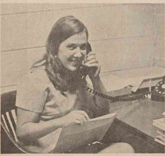
Communication is the key in student government.