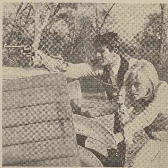
"Bonnie and Clyde" concludes the movie-showings for February. The film will be presented on February 22 in Hamrick Auditorium at 7:30 p.m.