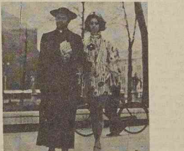
"The Priest's Wife" will be shown Thursday, March 22. This concludes the movie entertainment for March. A Laurel and Hardy Festival is planned for April 3, 4, 5.