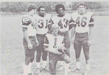
THE OFFENSIVE BACKFIELD ... looking forward to a Homecoming victory