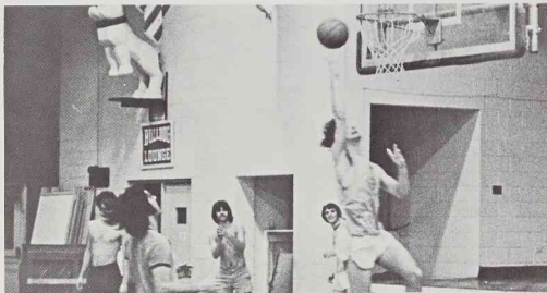
INTEREST IN INTRAMURAL SPORTS CAUSES CROWDED CONDITIONS.

The Bulldogs have one game remaining in regular season play. This will be with Baptist College of Charleston Feb. 22 in Bost Gym.