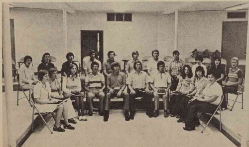
Chamber Chorus practices for this year's tour.