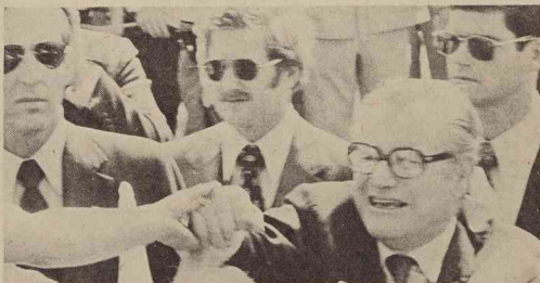
Vice-President Nelson Rockefeller greets well-wishers.