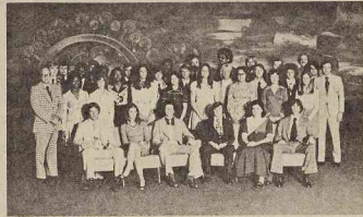
New Phi Beta Lambda members pose for camera.