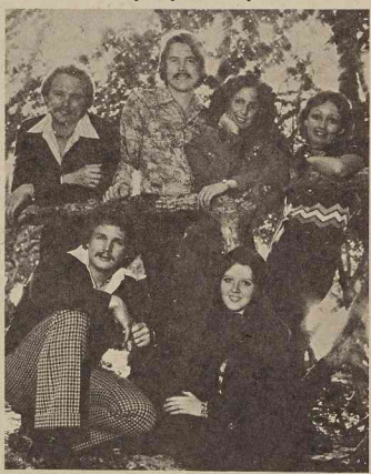
The Spirit of Truth will perform tomorrow morning in chapel and again after the evening revival service at 8:00 in Best Gym. The group is comprised of six young adults in full-time Christian music ministry.

Beginning on April 20 with student nurses and rising seniors, students can pick up their IBM printed schedule.