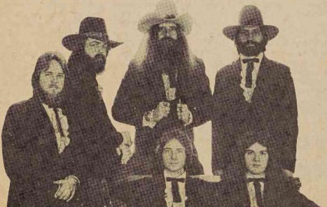
The Wright Brothers Overland Stage is back again at the Webb. A Homecoming Concert is planned for your enjoyment Saturday night in Bost Gym at 7:30.