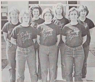
First Floor Decker-Basketball Champs