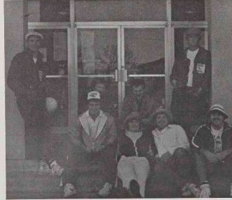
3rd Floor Lutz-Yelton-Volleyball Champs