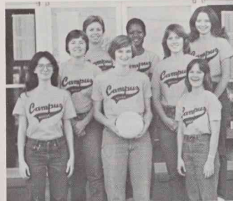
Campus House-Volleyball Winners