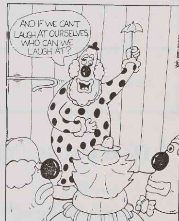
The Clown Philosopher.

The fun is just beginning as the winners grab for cash--up to $500. The S.E.A. invites you to take part in this pre-spring break jam!