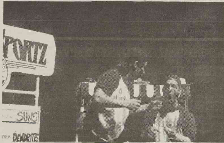
In a super-charged game of "Five Things", which is a wacky version of charades, one member of the Durham Dendrites tries to describe the phrase "fishing for llamas with a rubber glove pole" to his teammate. Audience members supplied all words used.