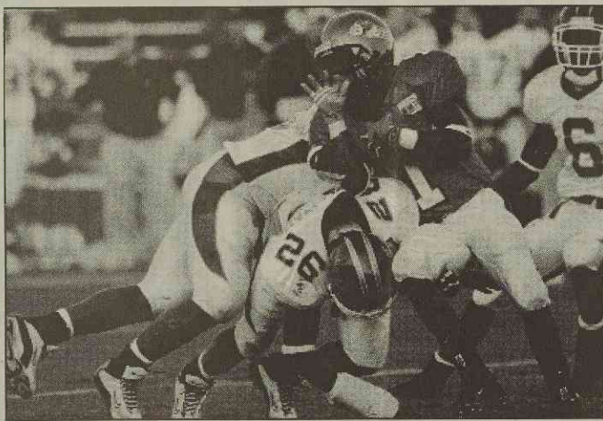
A Gardner-Webb football player breaks through several opponents during the Western Carolina game. The Bulldogs upset the 25th ranked Catamounts.