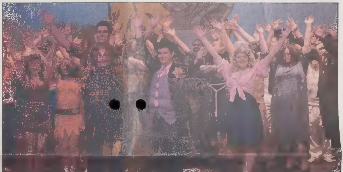
GWU's Production of Lil' Abner won an MTA for Outstanding Choreography.

"If it wasn't for our students... they are the ones that make up for the fact that we have a smaller program than other big schools and they do a great job."