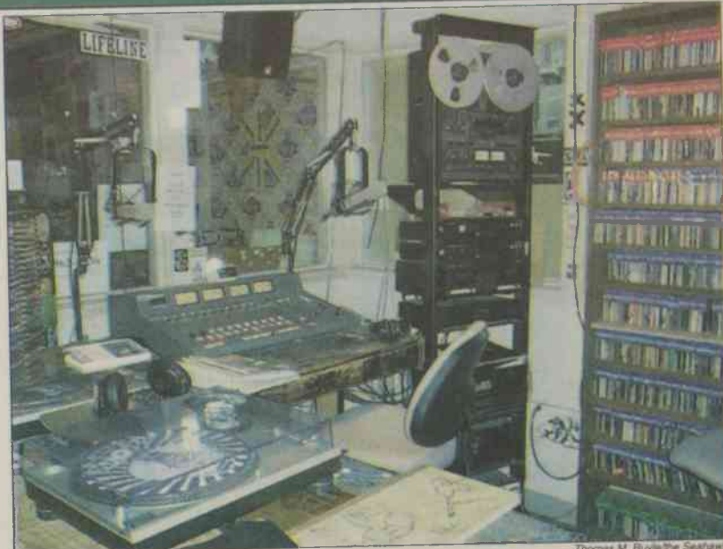
The broadcast studio at WLOZ has been vacant since it was ordered closed by the Student Media Board last Thursday evening. The station will remain closed until management problems are resolved.