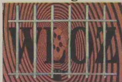
Illustration by Gabe Herman/ The Seahawk

The decision of the SMB comes one week after the WLOZ viability committee recommended to the board that they reopen the station with certain guidelines and conditions. After a lengthy and emotional discussion the SMB decided the station needs to remain closed until the WLOZ core group can make more progress.