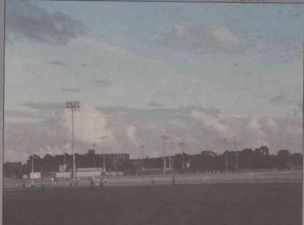
Students use Brooks field for intramurals and club sports practice year round.