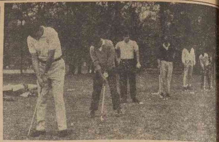
"The St. Andrews putters line up for some practice at the Scotch Meadows golf course."