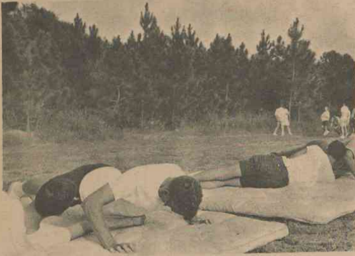
An incoming Freshman works hard at the push-up phase of physical fitness testing.