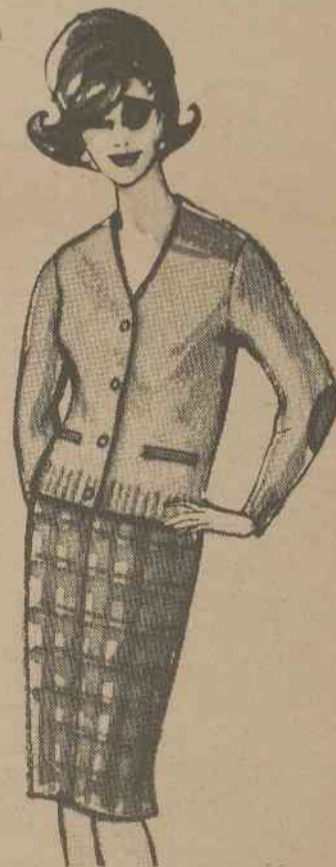
Man tailored with V-neck, real suede patches and slit-pockets. 75% Shetland, 25% Mohair. Colors: Egg shell, navy, burgandy, blue, black and lt. grey. Sizes 34-40

blue, black & lt. grey. Sizes 34-40. Popular "A"-line solid wool flannel skirt in colors to match all sweaters. sizes 6-18. $1.25