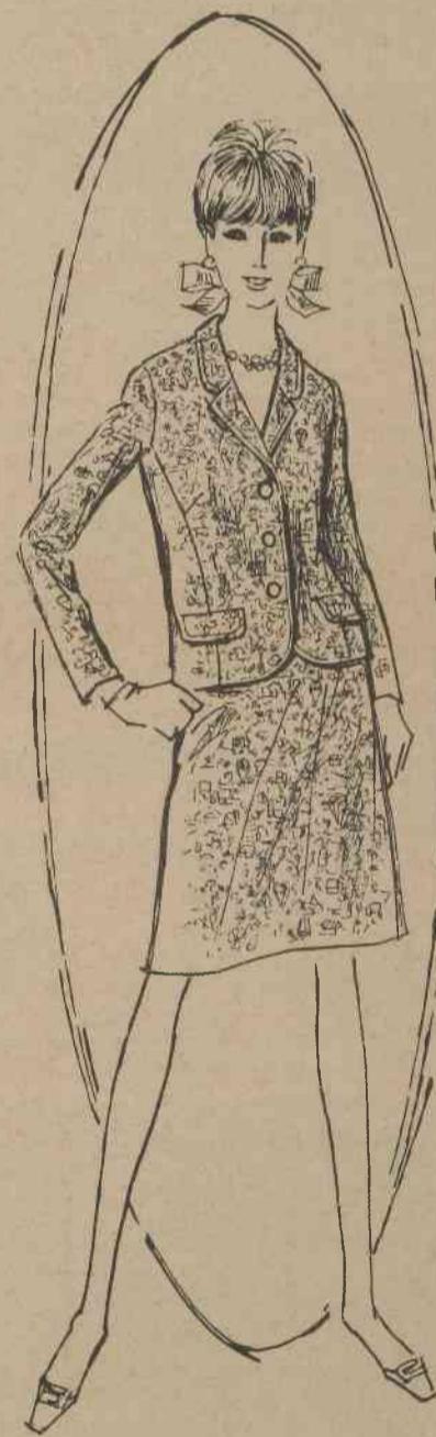
Summer in the city

Or spring in the suburbs . . . here is a suit that enjoys warmer climates with cool abandon. Designed by Seaton Hall in a refreshing print, with our favorite jacket and wonderful "A"-line skirt. 100% rayon.