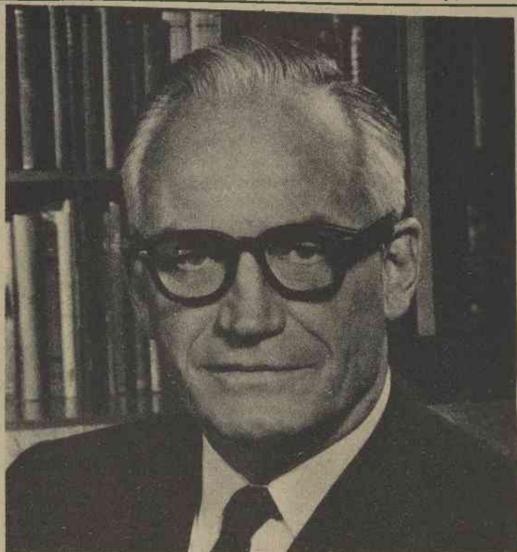
Former Senator Barry Goldwater to speak on campus Monday.