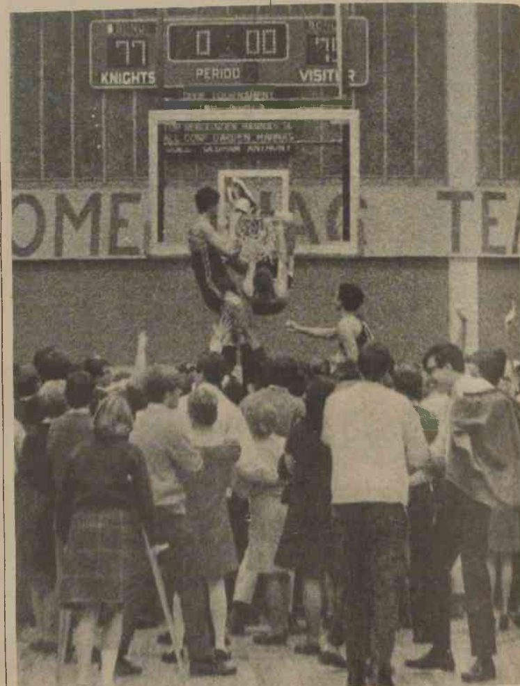
MEMBERS OF THE victorious St. Andrews basketball squad hang from the backboard and rim as they take down the net celebrating their 77-75 win over Lynchburg College in the finals.