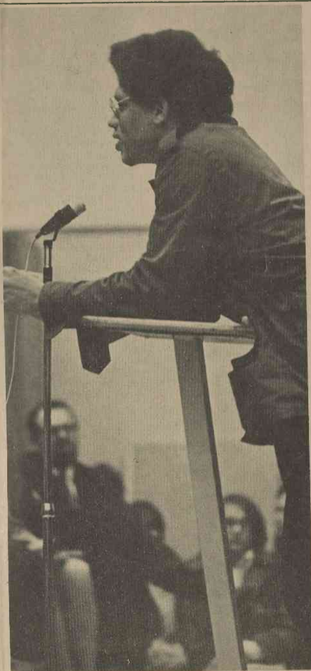
MICKEY LELAND addresses the senior C&C classes concerning his views on Black Militancy. He and one other militant spent five days on campus discussing issues with students.