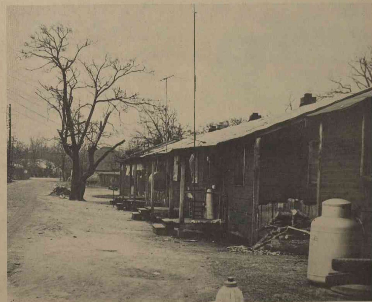
THIS SCENE could be shot in any city of the United States today. But it was taken in Washington Park, only two miles from the St. Andrews campus. The run down shacks, unkempt streets, and other signs of neglect are all signs of the "poor man's" America.

The St. Andrews Student Senate is presently considering a bill which would give the Inter-Dormitory Council complete authority in regulating open dorm policy. The bill, which originated in the Social Welfare Committee, was formulated on the premise that each dormitory council is "in direct and immediate contact with the needs and desires of the residents of its own particular dorm," and therefore in the best position to establish that dorm's open dorm regulations. The I.D.C. has tacitly agreed to allow each dorm council to set its own policies once the bill has been passed.