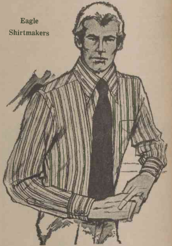
Eagle is cotton. We brought back the good old shirts.