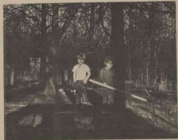
Create hope for these children in Laurinburg. The Peace Corps is conducting a campaign for more tutors, desperately needed to widen its reach within the community. Sign-up at the student host desk in the College Union or attend the general meeting at 7:30 on Tuesday in the Conference Room.